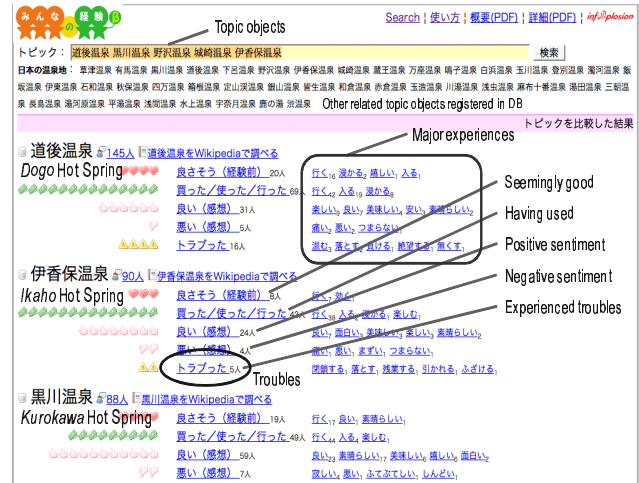
Figure 2: A snapshot of the summary view of the experience search engine

We next automatically extracted sentence-chunked texts from the weblog post set, and conducted tokenization and POS tagging with ChaSen 3 and dependency parsing with CaboCha 4 . We then carried out experience mining on the parsed texts and finally obtained over 50M experience instances related to one of our keywords and stored all of them in a relational database.