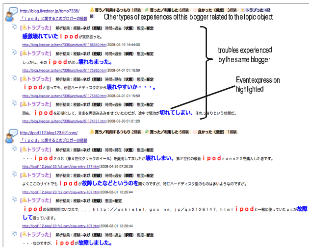
Figure 3: A snapshot of the experience view showing troubles experienced while using iPod

more important his/her mentions about it are. Based on this assumption, the system also allows a user to browse a blogger's experiences with a topic object in chronological order, possibly a clue regarding the blogger's background (expert, confederate, etc.).