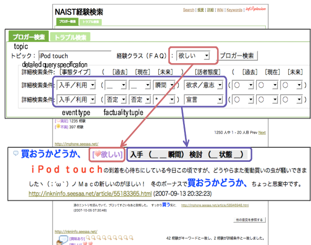
Figure 4: A snapshot of the system view customized for corporate marketing research

opinions from an explosive number of UGCs such as weblog and forum posts and storing them in an experience database with semantically rich indices. Experience mining can be regarded as a substantial extension of opinion mining. Opinion mining has so far tended to aim at extracting sentiment information mainly from explicit evaluative or emotional expressions such as useful (positive) or disturbing (negative) [1, 3, 8, etc.]. On the other hand, experience mining covers all the descriptions of events that are related to any use of a wide variety of topic objects including so-called implicit evaluative descriptions .